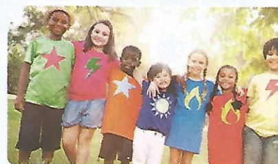
Make new friends