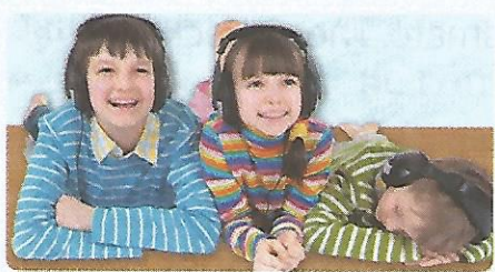
Listen to songs.