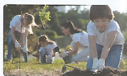
Care about plants