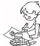
Drawing (draing) Dibujar