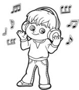
Listening music (lisening miusic) Escuchando música