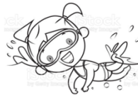
Swimming (suiming) Nadar