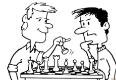
Playing chess (pleing ches) Jugar ajedrez