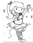
Singing (singing) Cantar