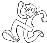
Running (raining) Correr