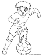
Playing soccer (pleing soker) Jugar fútbol