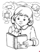
Reading (riding) Leer